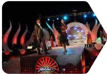
The overall runners for Mokshaa '13 were Ramakrishna Dental College, Coimbatore