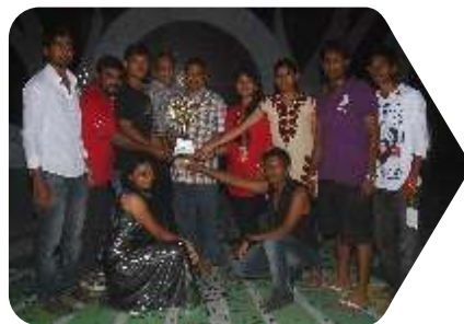
The Overall Championship was won by RVS Dental College, Coimbatore.