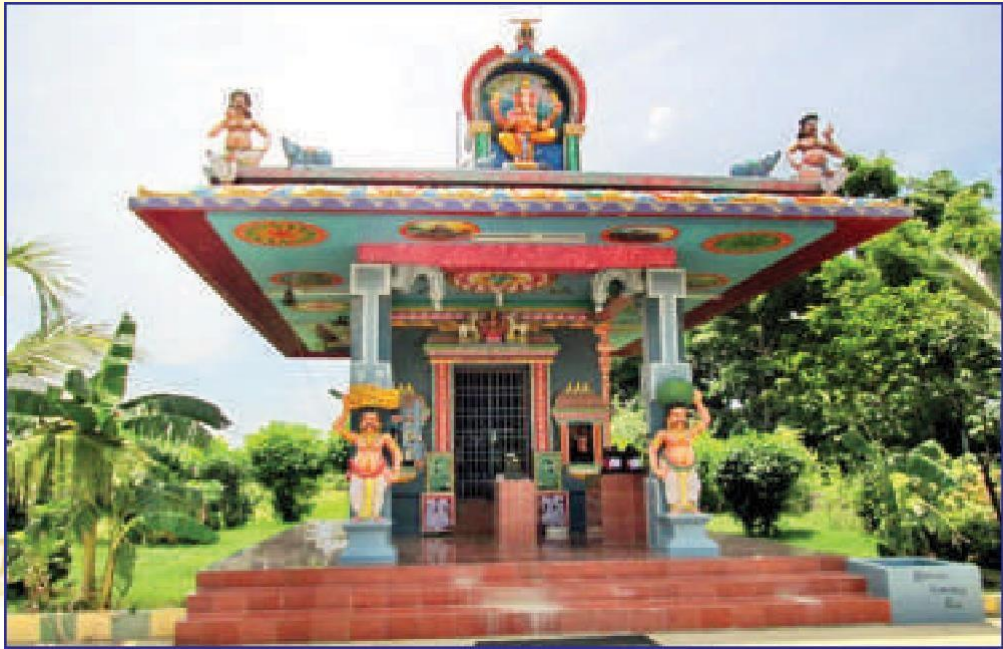
Sri Gnana Vinayagar Temple