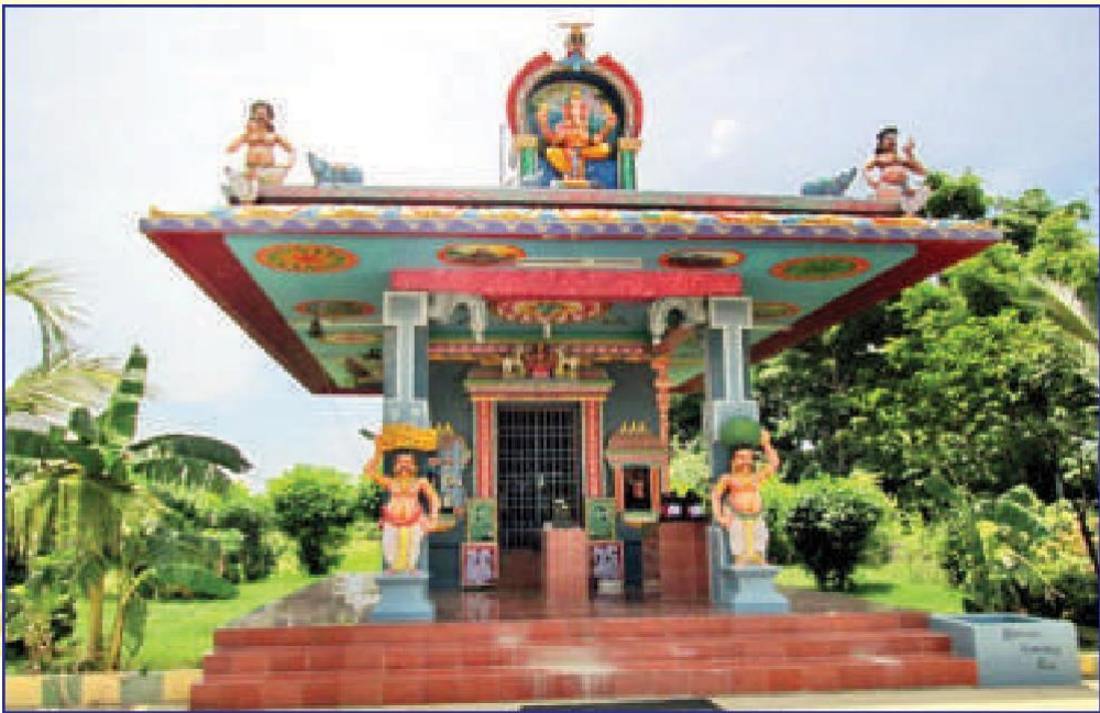
Sri Gnana Vinayagar Temple